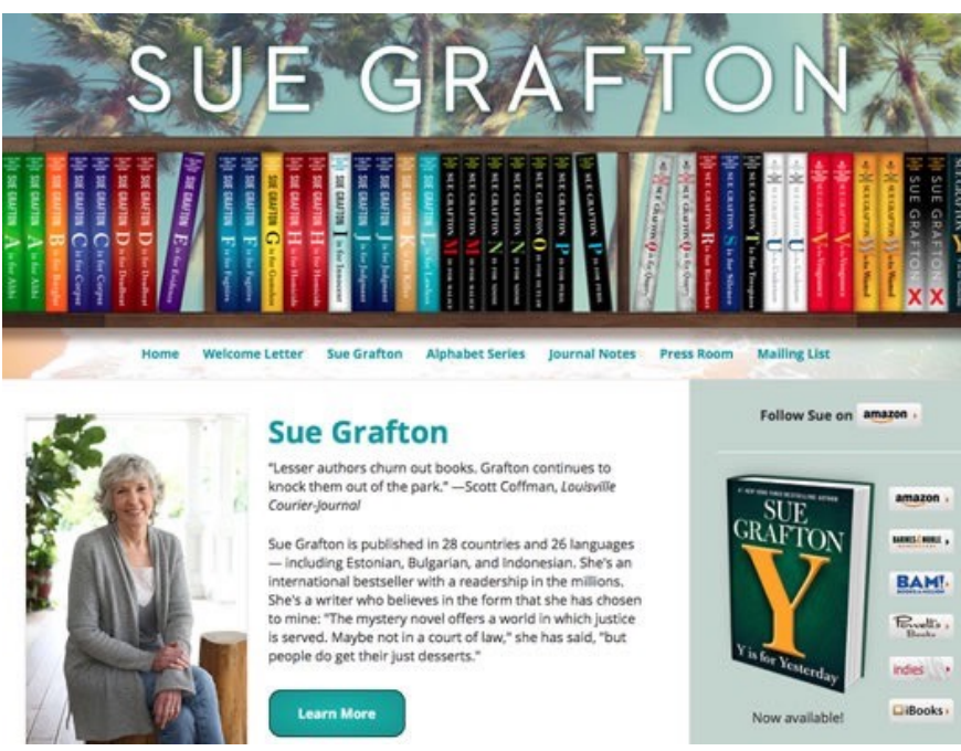
Pub-Site.com | FSBAssociates.com