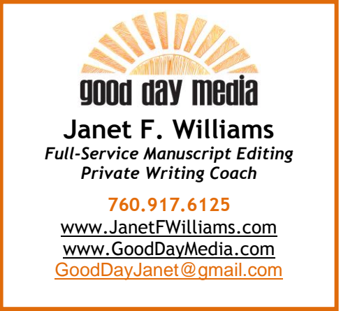
Social Media Liaison