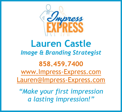
Newsletter Circulation Manager