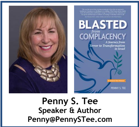
PWOC Meeting Scribe